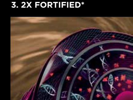
The hair strand is 2X FORTIFIED* and infused with COLOR