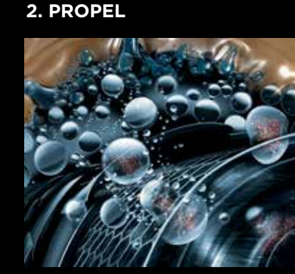
ODS<sup>2</sup> propels DYES and PROTEIN EXTRACTS into the cortex