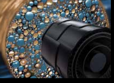
A mixture of DYES, OIL and PROTEIN EXTRACTS surrounds hair's cuticle