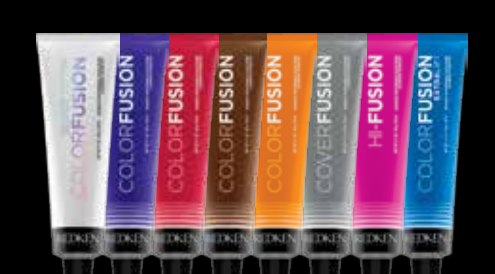
COLOR FUSION NEW SUPER GLOW SHADES Natural-looking, multi-dimensional results with condition and shine.